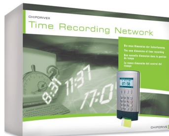
CHIPDRIVE® Time Recording Network