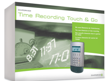
CHIPDRIVE® Time Recording Touch & Go