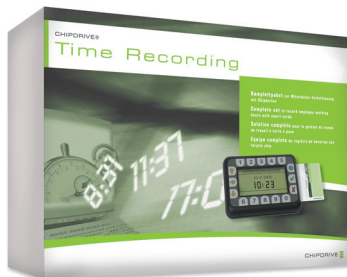
CHIPDRIVE® Time Recording

Each time recording device in the system is uniquely identified by the system so you can see which device was used for each booking.